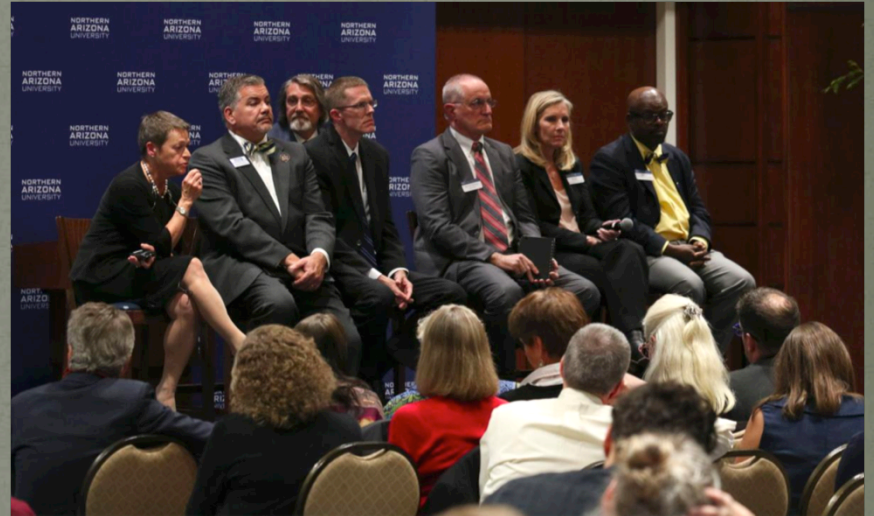
Our context definers